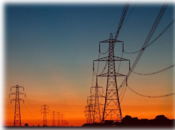
Fig. 1- Electric power lines

Through an analysis aimed at identifying and classifying the risks and threats, these economic sectors determine the Internal and External Emergency Plans whose manuals contain all the information necessary to control each type of emergency within the public facility and commercial areas that may be affected.